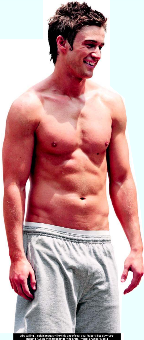
Abs sailing... celeb images - like this one of real deal Robert Buckley - are enticing Aussie men to go under the knife.

Don't think that plastic surgery and grooming procedures are just for the ladies. Step up, boys writes NATASHA GRANATH.