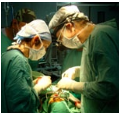
surgery in Samoa